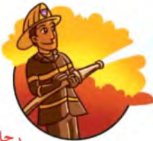
رجل إطفاء firefighter p42