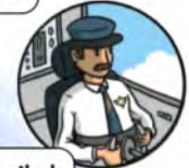
4. pilot طيار