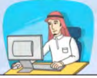
10. computer technician تقني كمبيوتر