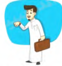
businessman p42 رجل أعمال