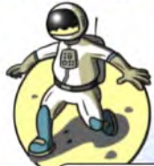
1. astronaut رائد فضاء