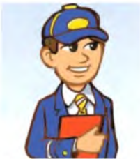
school uniform p66 زي المدرسة