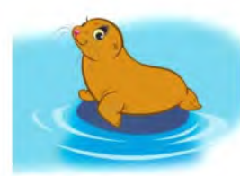
seal p12 عجل البحر