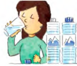
drink (drank) يشرب p74