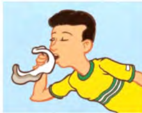
catch a cold p58 يلتقط البرد