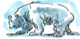
الدب القطبي polar bear p15