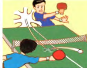
table tennis تنس طاولة p59