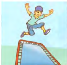
الترامبولين trampoline p50