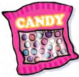
candy p84 حلوى