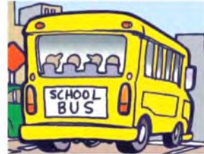
school bus p66 باص المدرسة