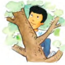
climb p93 يتسلق