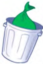
يخرج القمامة take out the trash p26