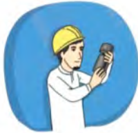
مهندس engineer p42