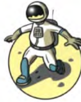
astronaut p42 رجل فضاء