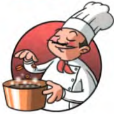
cook p42 طباخ