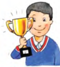
win (a prize) يفوز بجائزة p58