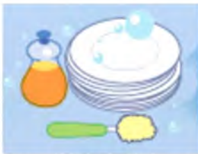
wash the dishes يغسل الصحون p26