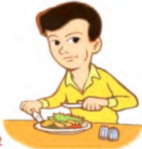
ياكل ثلاث وجبات eat three meals p74