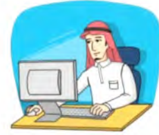
computer technician p42 فني حاسب