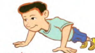
يقوم ببعض التمارين do some exercise p74