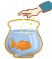
feed the fish يطعم الأسماك p26