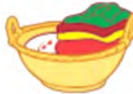
اطوي الغسيل fold the laundry p26