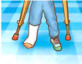
break (broke) p58 يكسر