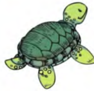
سلحفاة turtle p15