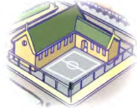
مدرسة الإبتدائية elementary school p82