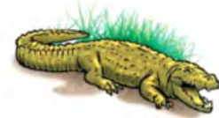
تمساح crocodile p15