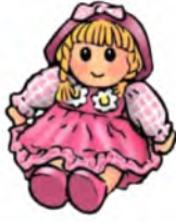
دلعين doll p86