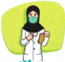
nurse p42 ممرضة