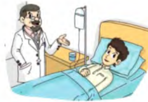
doctor p42 دمية