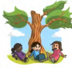
meet my friends ألتقي بأصدقائي p38