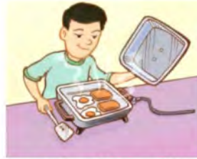
cooked (cook) يطبخ p50