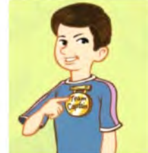
team captain كابتن الفريق p58