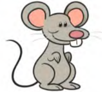
mouse p15 فأر