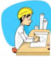
architect p42 مهندس معماري