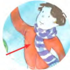
شال scarf p72