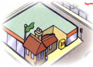
مكتب البريد post office p82