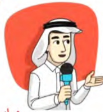
مراسل reporter p42