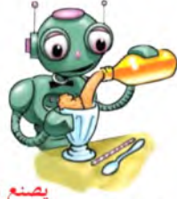
يصنع شراب make a drink p30