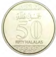
coin p24 عملة نقدية