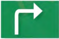
يمين right p83