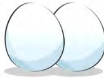
بيض eggs p85