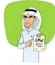
محامي lawyer p42