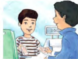
change p81 يصرف