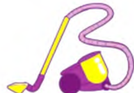
vacuum the floor يكس الأرضية p26