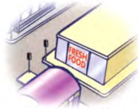
supermarket سوبر ماركت p82