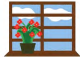
window p16 نافذة