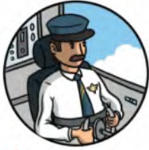
طيار pilot p42