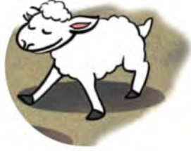
lamb p70 خروف