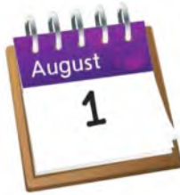
day p8 يوم