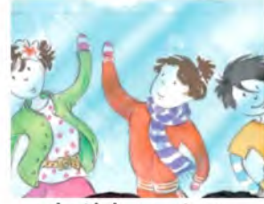
clothing store محل الملابس p81