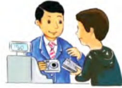
bought (buy) p96 يشترى