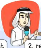
2. reporter مذيع