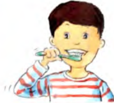
brush my teeth p38 يفرش أسانه