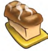
bake bread p30 يخبز الخبز