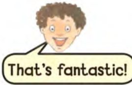
رائع fantastic p50