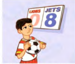
lose a game يخسر لعبة p58