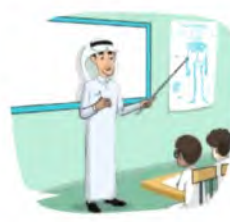
teacher p42 معلم