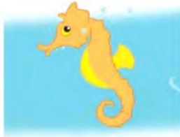
seahorse p12 فرس البحر