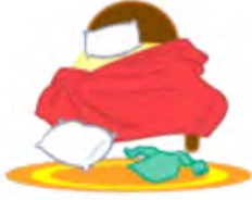
clean up your room p26 نظف غرفتك