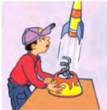
make a rocket يصنع صاروخ p58