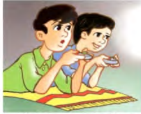
يلعب ألعاب الحاسب play computer games p50