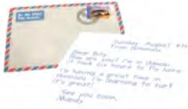
رسالة letter p86