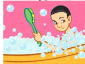
take a bath يغتسل p36