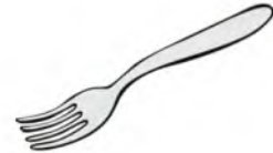
fork p32 شوكة