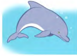
dolphin p12 طيب